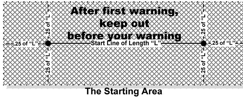
Diagram 1 The Starting Area – All Races

After the first warning signal for a race and prior to her warning signal, a sailboat shall keep clear of the starting area that extends one-quarter of the length of the starting line ahead of and behind the starting line. It shall also extend one-quarter of the length of the starting line past either end of the starting line